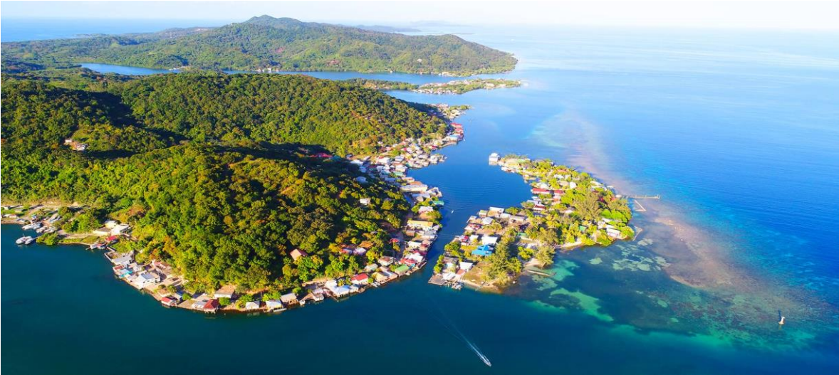
Oak Ridge, East of Roatan, Bay Islands of Honduras